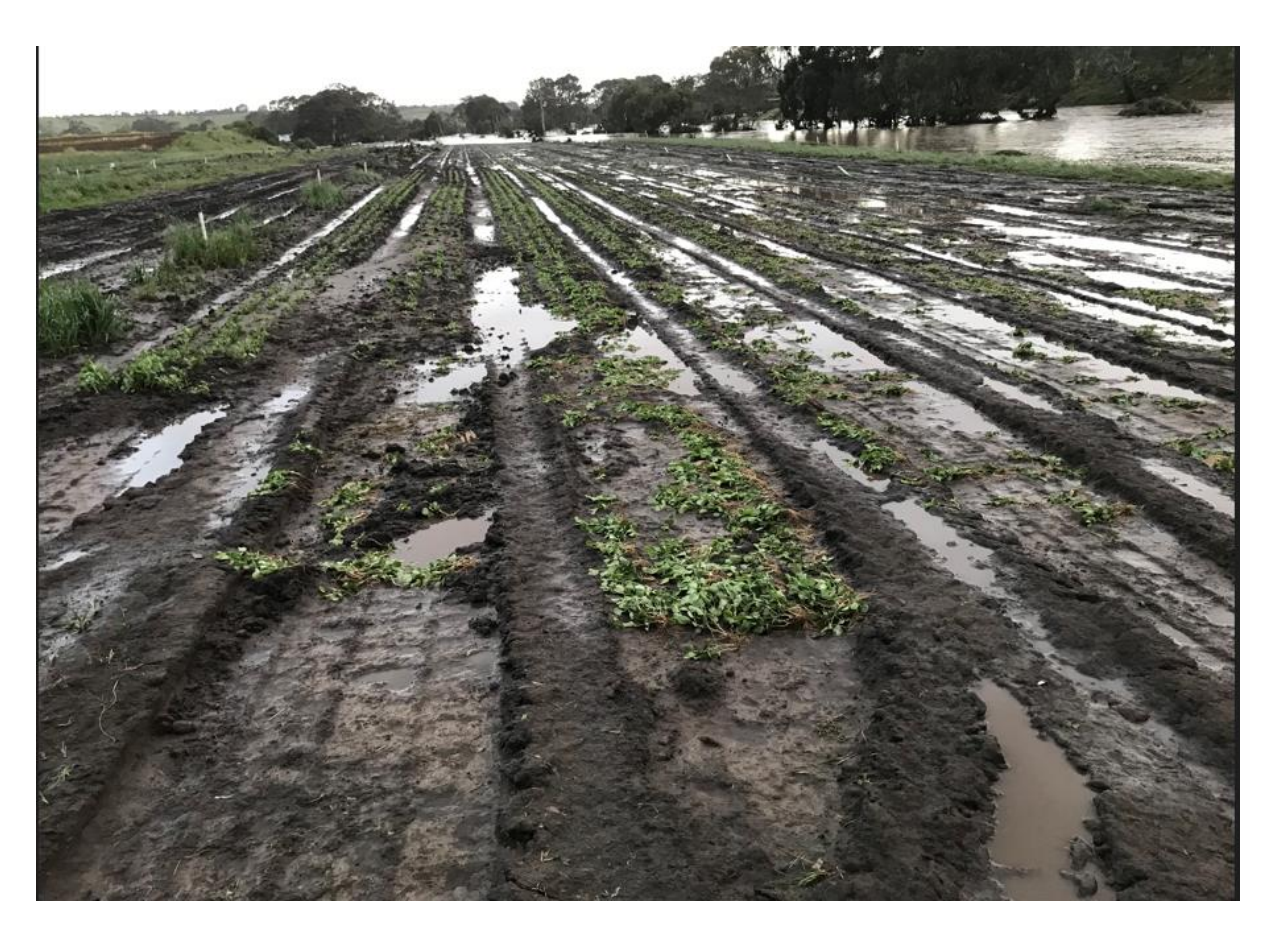
Crop & top soil washed away