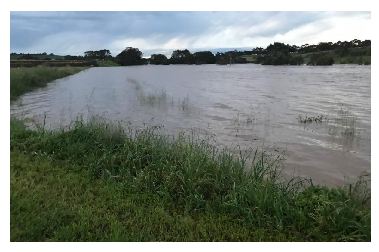
Cropped paddock underwater, mains power pole in distance