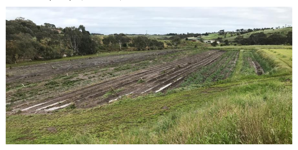
Damage & crop loss after water receded