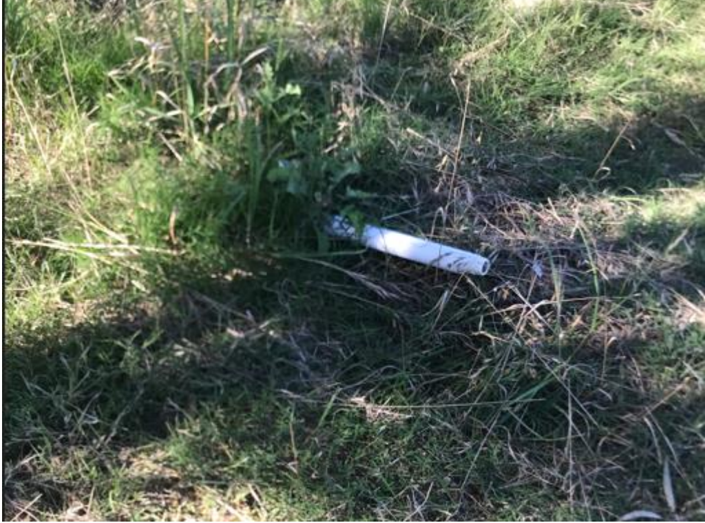
Sprinkler head damaged & to be replaced