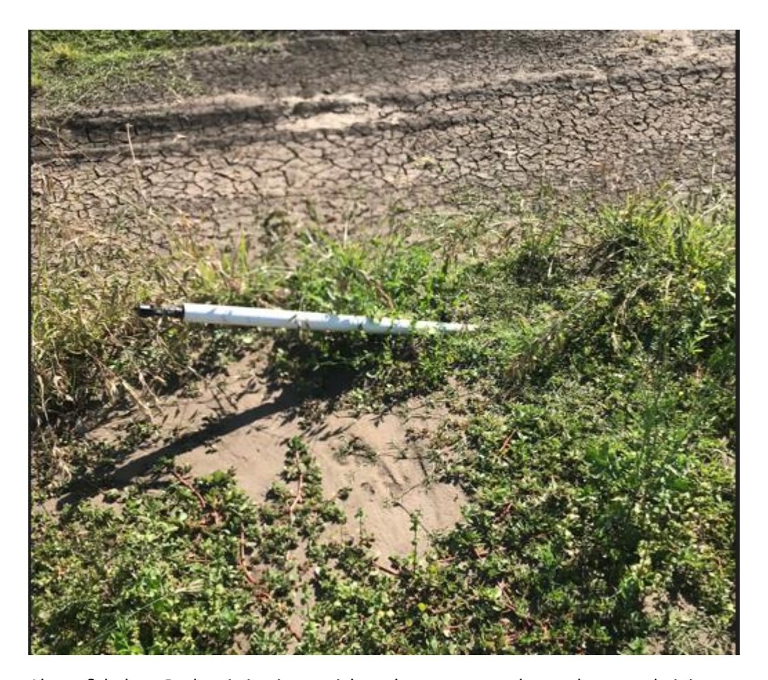
Above & below: Broken irrigation upright to be reconnected to underground piping