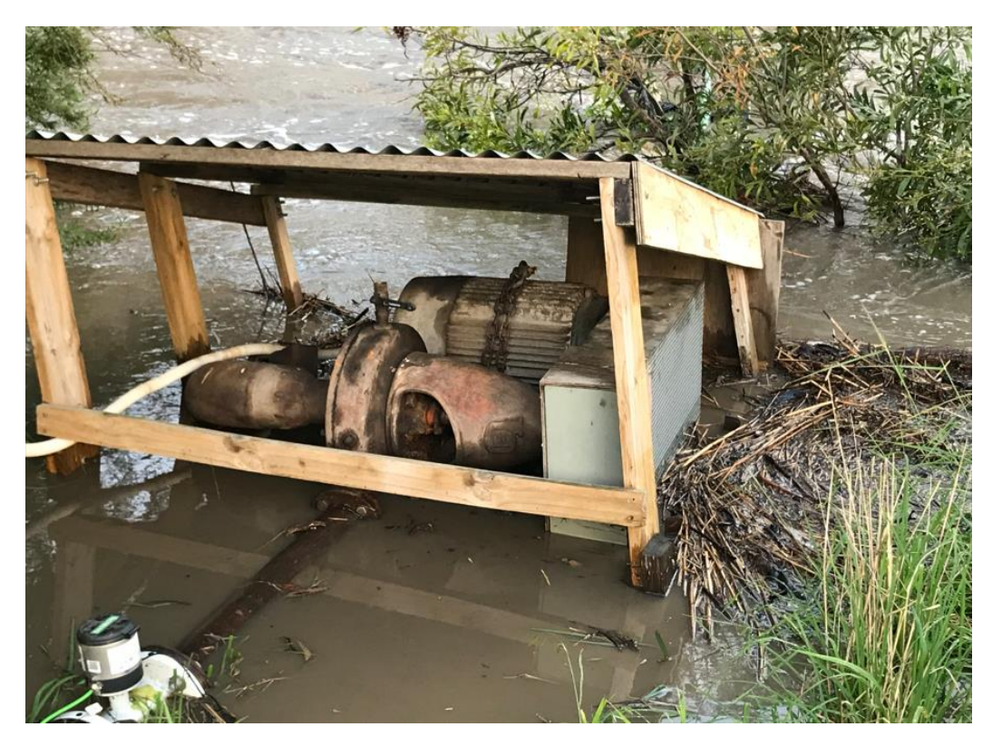
Above: Pump & electric motor, immediately preceding Maribyrnong River flood