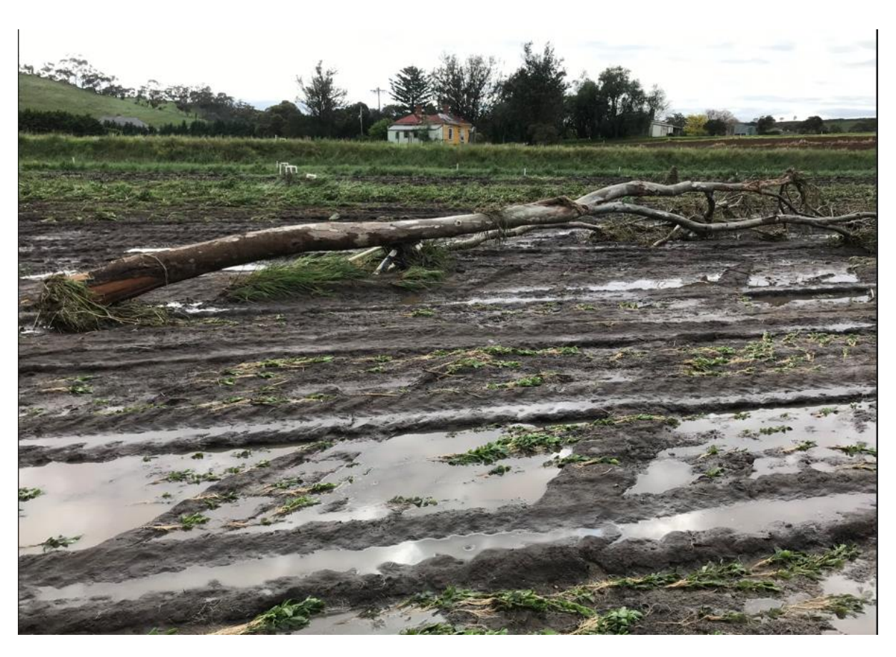
Tree limb in paddock, crushing irrigation "hurdle"