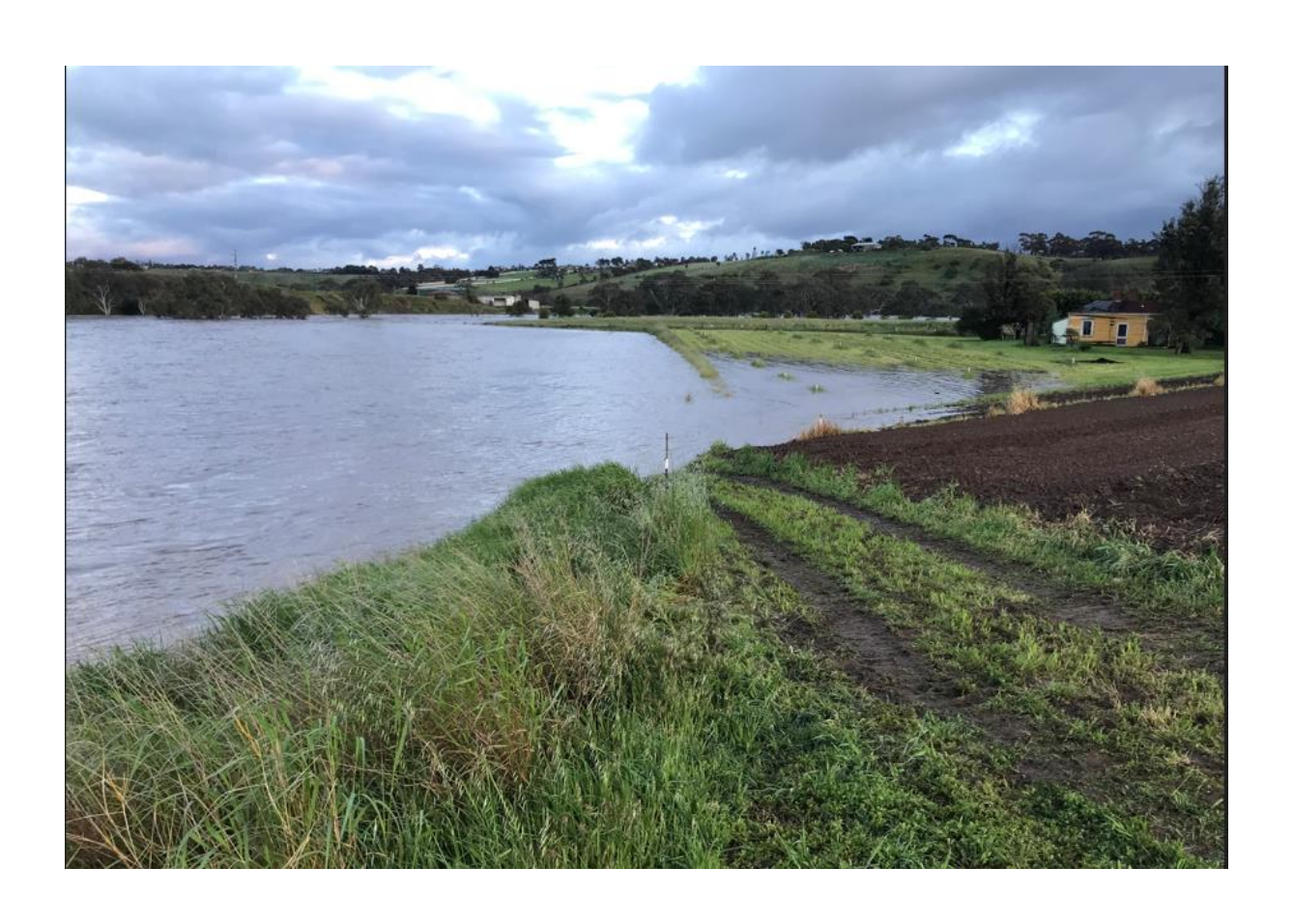
Cropped paddock underwater, river at left