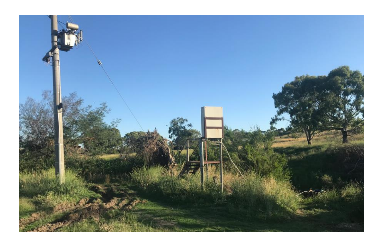
Mains power pole, switchboard, pump installation at far right, debris evident on power pole strain wire