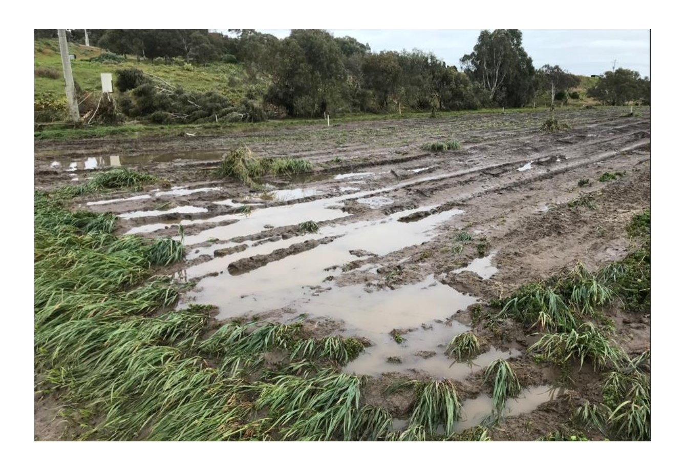
Note debris on power pole, switchboard, fallen tree